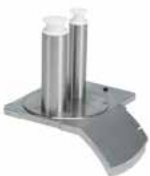
Long vegetable attachment