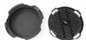
Grid cleaner kit