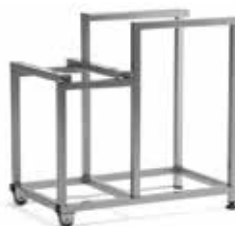
Stand - trolley